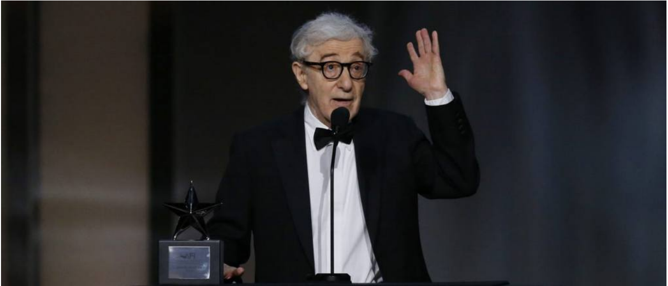
Director Woody Allen speaks at the 2017 American Film Institute Life Achievement Award Show, Los Angeles, California, 08/06/2017